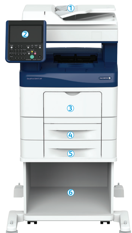
DocuPrint CM415 AP full configuration